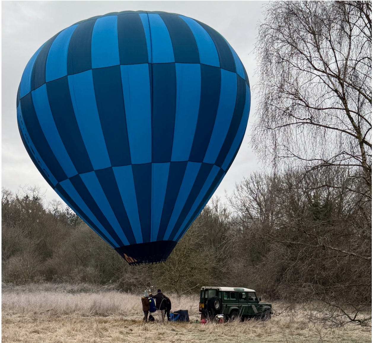
Rarely seen these days G-BWHD LBL 31A

present willing to fly including some rarer examples. G-BWHD whilst fairly local , has never been the most common of LBL-31A's and this flew. G-SIPP , a LBL 35A from the Manchester region of the country made a rare southerly visitation which was also nice to see. At least another five envelopes flew out of a total of around 22-24 balloons booked into the event. Star of the morning wasn't even a