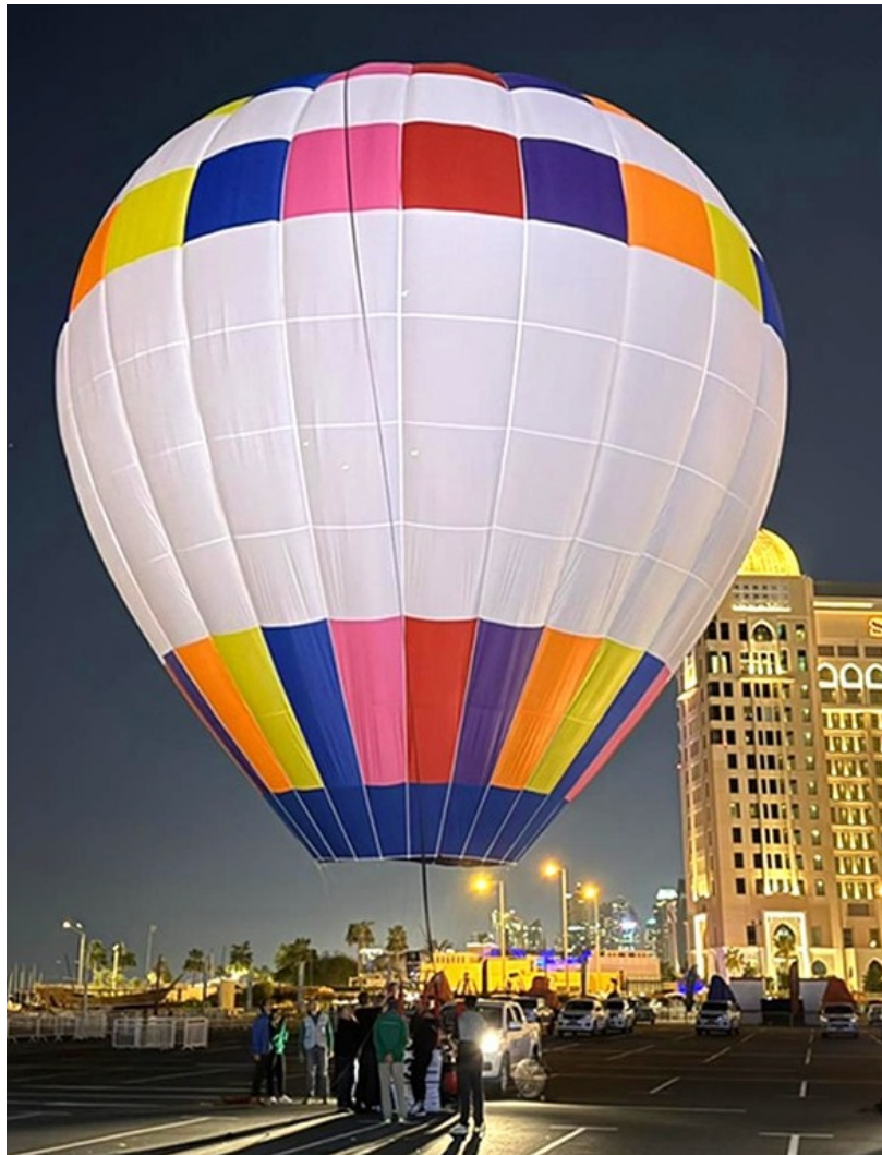
QBF5 – Home built balloon from Qatar

to fly during the event itself and hats off to all involved with its manufacture. Whilst strictly not a hopper the fact that a prolific hopper builder did this seems enough reason to me for its inclusion.