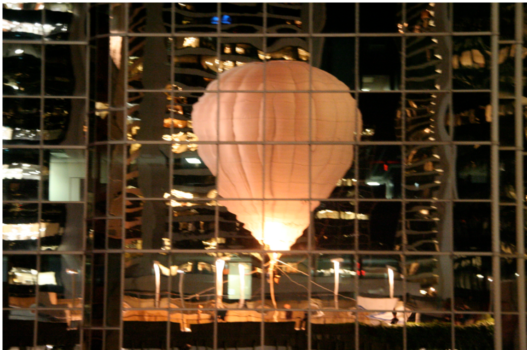
Classy shot of the hopper reflecting in a skyscraper

They had an idea that would utilise a Cloudhopper in the storyline and Ian was their choice to facilitate it. The project was discussed at length before it was agreed and in order to see a Cloudhopper in full effect, the advertising agency went to Chateau D'oex in 2007 to witness one up close and personally. Agreeing to its suitability the project had a story line which was agreed and Ian contacted Cameron Balloons in Bristol with a very specific wish list. He wanted two all silver Z-31 's for the filming , using one bottom end and Cameron's needed to assist with building a framework that would look like the bottom of an envelope under which the Hopper bottom end could be slung for the close-up work.