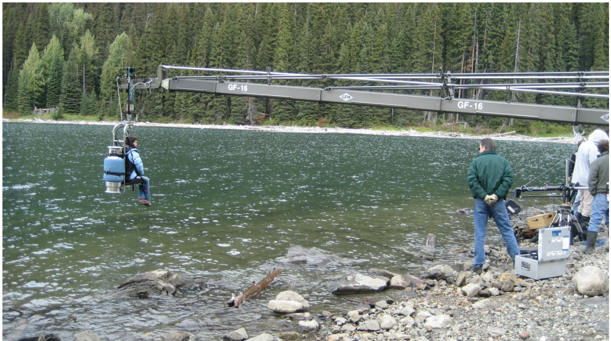
Preparation of the shots over the lake.

. Ian maintained storage for the production company of the two lightly used hoppers until they required disposing of having been purchased by Wye Valley Aviation from Knuckleheads. Ultimately these were then sold on in 2012 , one going to France and the second living on in Austria.