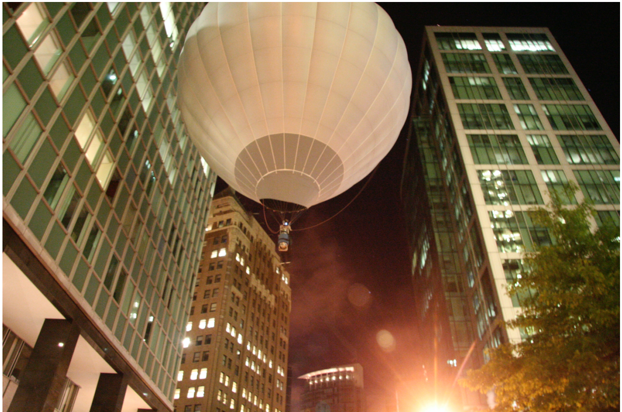
Filming at night in Vancouver

Two Shiny new Z-31s appeared in G-CESX and G-CESY both not showing any external registrations for the project. Silver was chosen as it would look great at night and be neutral to the colour of the vehicle which would be red.