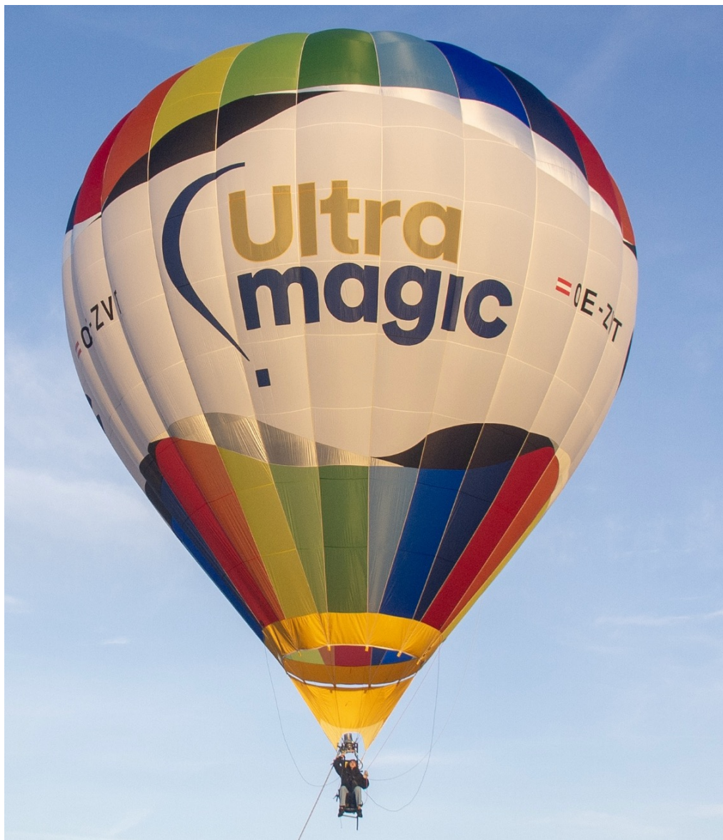
OE-ZVT Um M-42 built in 2024

This section is your editors' chance to find interesting photographs either from his own collection or from stuff submitted for the newsletter, or alternatively something that featured on the Cloudhoppers Facebook page during the month. Struggling this month to find anything apt so Ill dive back into my photographic library for something seldom seen.