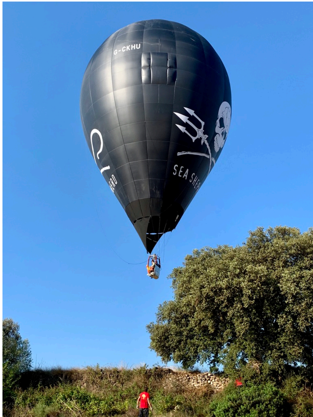
G-CKHU over the Duo Chariot in Iguillada Spain.