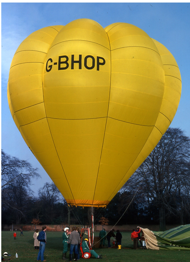
G-BHOP a classic example of a Thunder Ax3-17 Mini Sky Chariot

Mini – 17,500. Cu.ft, – Single Worthington tank.