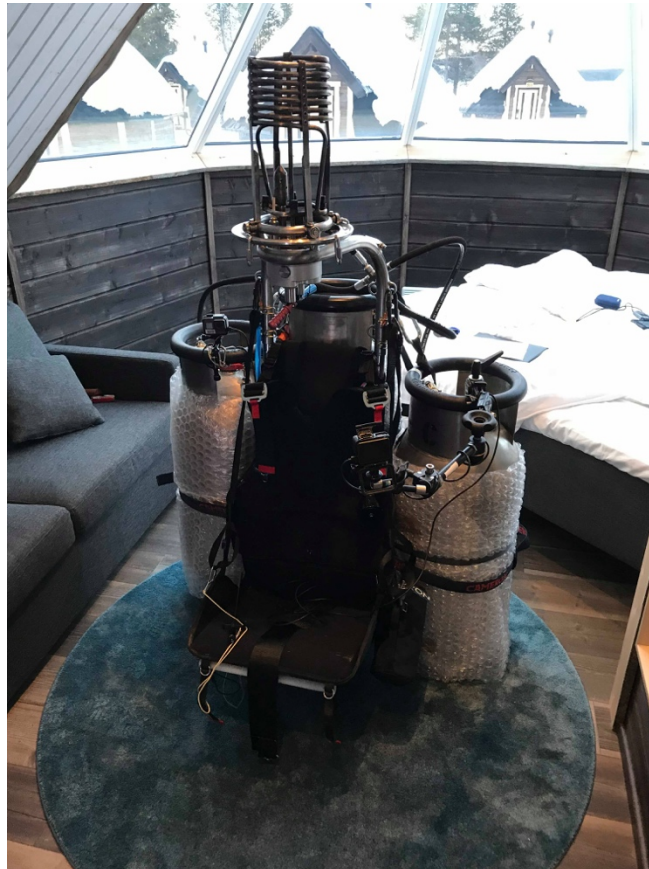
“The Blue Peter Special Bottom End”

This was then extended to the slightly more reserved Bling up your bottom end which whilst still popular is taking longer to emerge as a regular feature. The idea behind the bottom end feature is to introduce versions of different solutions to spark people's imagination of what is possible and encouraging during the lockdown people get out there and maintain and polish the bits that tend to get neglected and taken for granted.