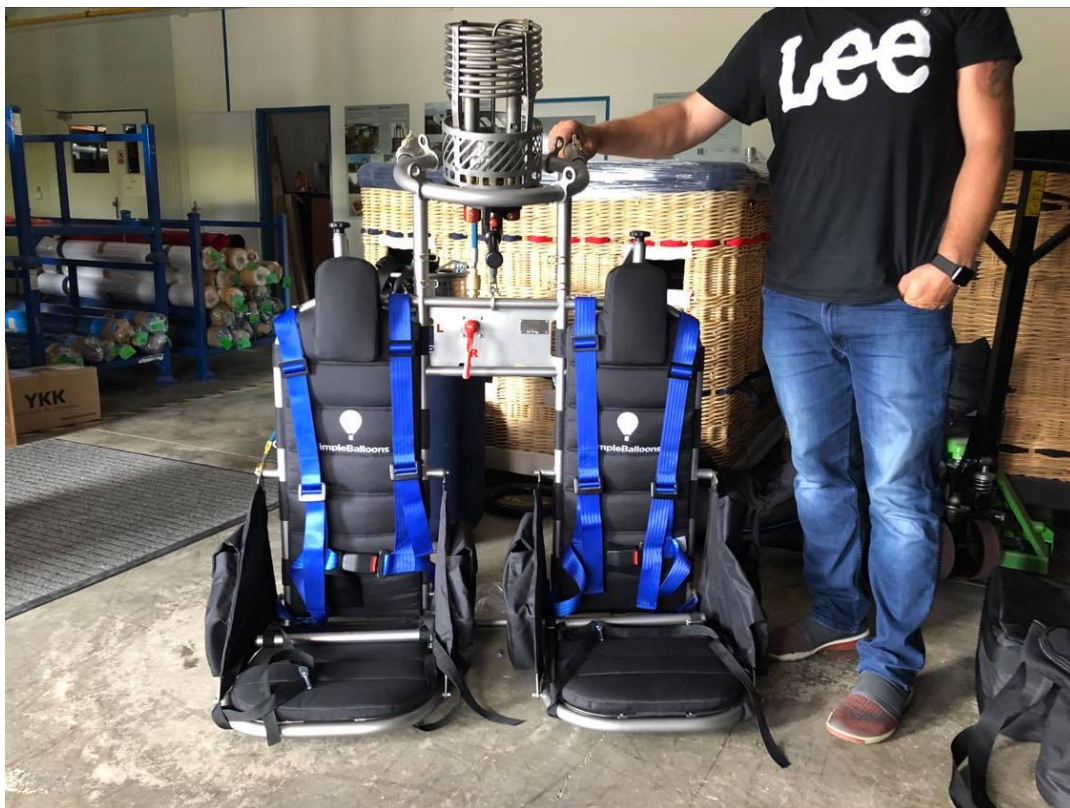
The Nanoo duo bottom end.